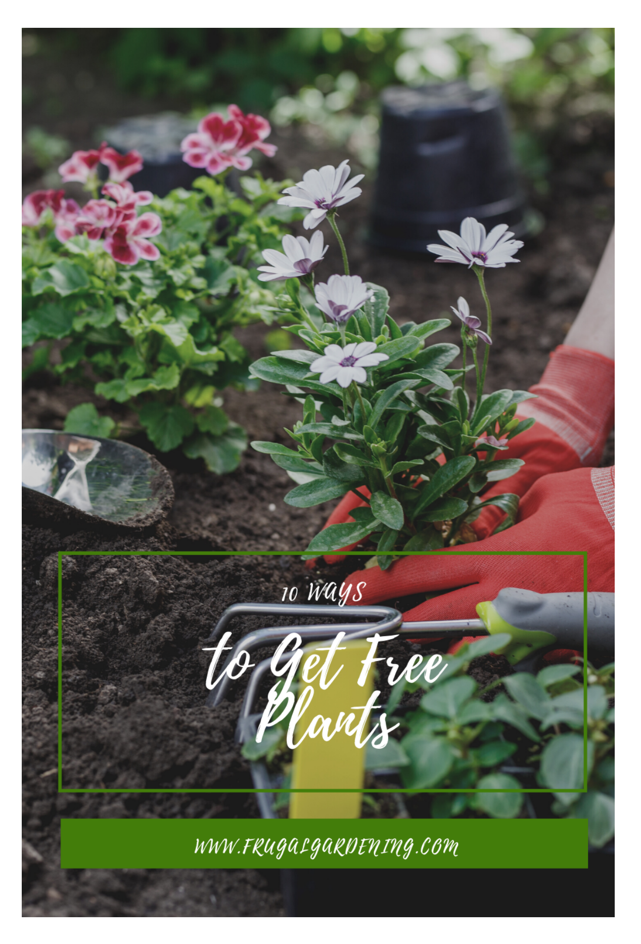
Get free plants and save money on your favorite pastime. While gardening is one of the largest hobbies in the US, how